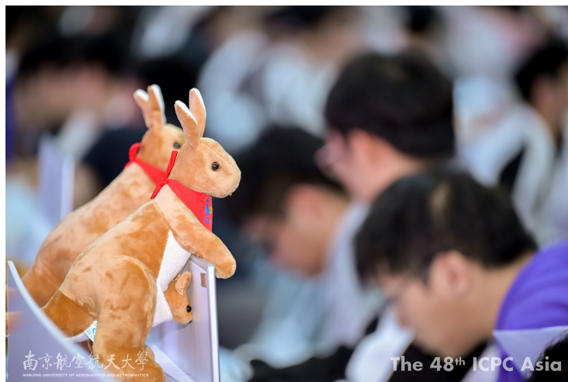
Photo taken in the 2023 ICPC Asia Nanjing Regional Contest

This year, around 335 teams are participating in the contest. At most 33 gold medals, 66 silver medals, and 99 bronze medals will be awarded (note that these numbers are for reference only). We are looking forward to seeing the participants' outstanding performance! We also want to express our gratitude for the hard work done by all staff and volunteers for this contest. Thank you all for your great contribution to this contest!